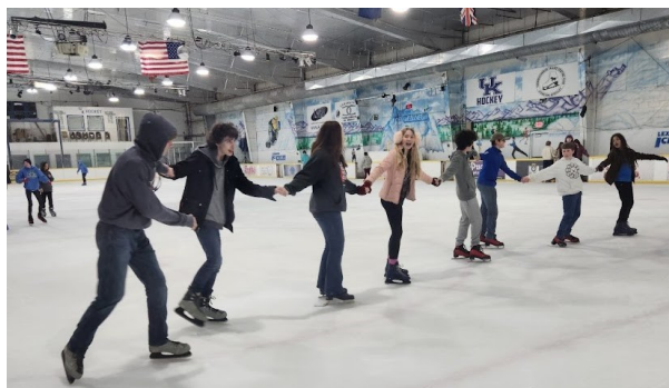
Ice skating at the Lexington Ice Center

February gave us opportunities to serve the littles and collaborate with CLC. Our big kids did crafts and shared a snack with the little ones. We also took a senior outing to throw axes, ride go-karts and bowl. February also held one of my favorite outings - ice skating. It is so fun to watch the youth of all abilities help each other and have fun!