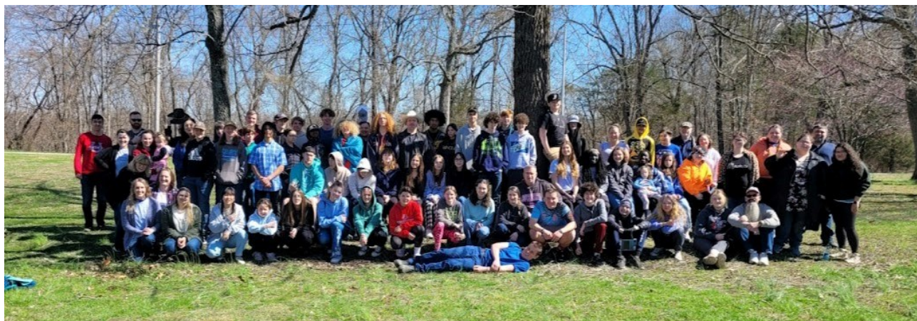
Spring Retreat 2023 at Eagle Ridge Retreat Center in Bowling Green, KY

First off let me thank all of you who pray for and serve our youth in a variety of ways. It is extra appreciated as I have been in a time of low physical energy and ability. The teens in our church and community never cease to amaze me with their desire to grow in the Lord, their care for each other, and in their creativity.