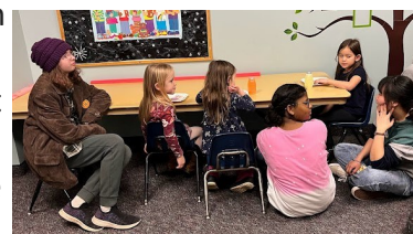
Teens helped with CLC

2023 has been off to an eventful start! We went to Winter Jam at Rupp arena and hit the slopes in January for the annual ski trip. We seem to always be blessed with diverse weather while traveling, but we made the most out of the fluff snow on our return trip morning and had a snowball fight.