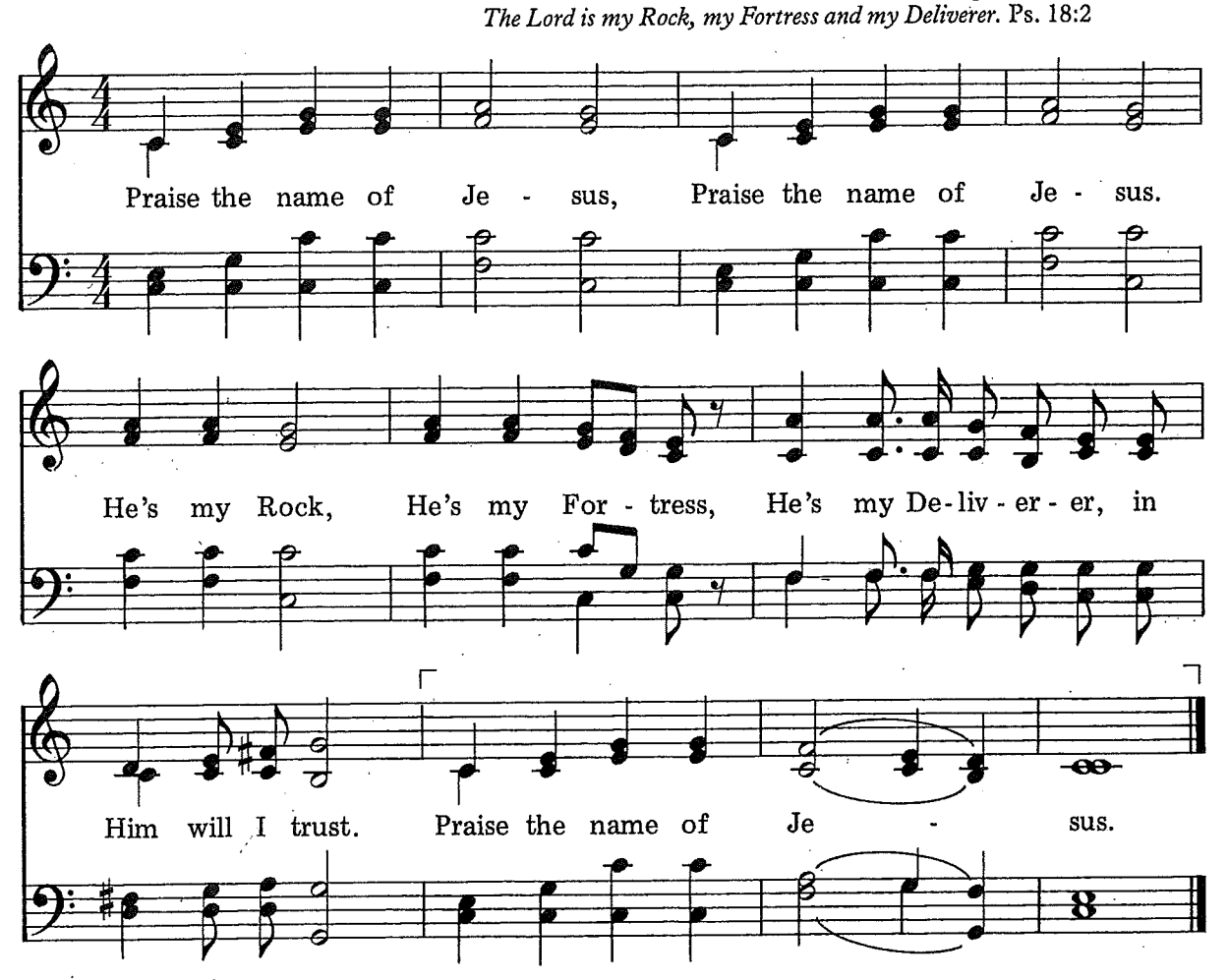
TEXT and MUSIC: Roy Hicks, Jr.; based on Psalm 18:1