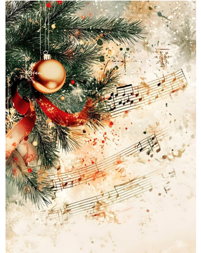
Musical Celebration of Christmas

If you seek or have found salvation or sanctification today, please let a member of the pastoral staff know. We're here to help you on your journey with Jesus.