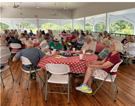
September Luncheon at High Bridge