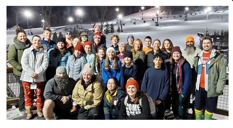
Perfect North Ski Slopes in Lawrenceburg, Indiana