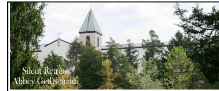
Silent Retreat Abbey Gethsemani

Silent Retreat at the ABBAY OF GETHSEMANI Trappist, KY Saturday, April 20